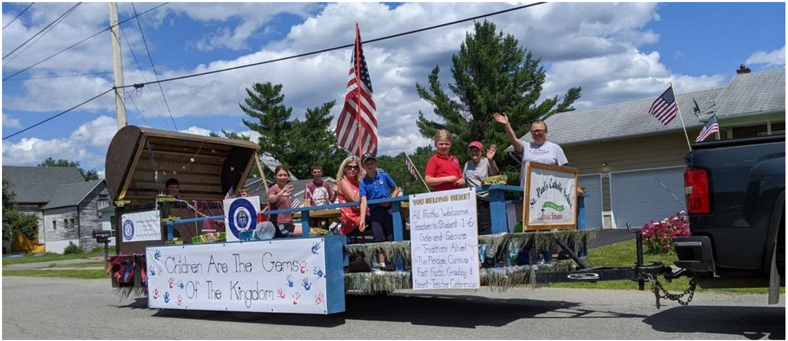
Above: July 4 th parade themed: Kingdom Treasures. We titled our float "Children are the gems of the Kingdom". We won first place. God bless America!