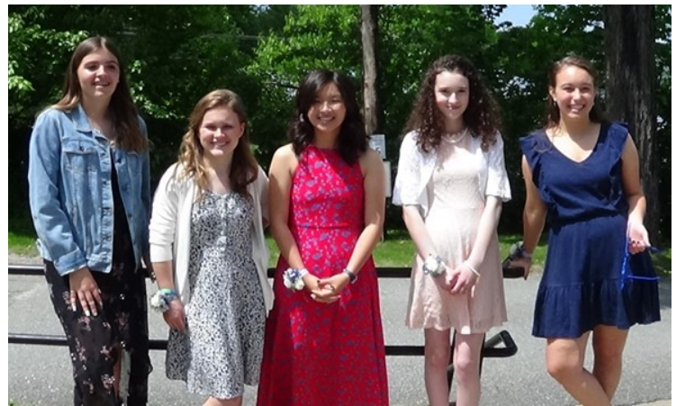
Congratulations Class of 2022- the 125th graduating class of Saint Paul's Catholic School!

Our Prekindergarten program is full this year. We can take students who are 3 or 4 years old. This year we were recertified by the State as a 4 STARS program.