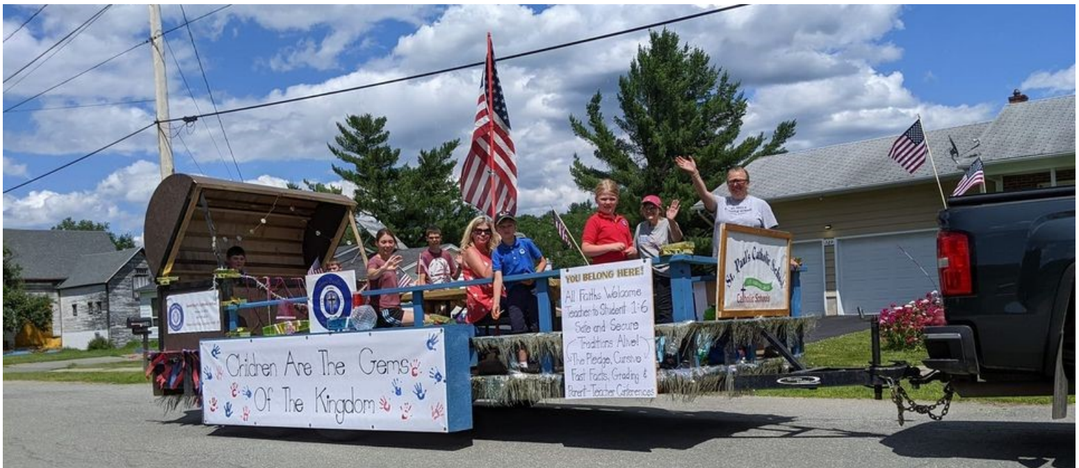
Above: July 4 th parade themed: Kingdom Treasures. We titled our float "Children are the gems of the Kingdom". We won first place. God bless America!